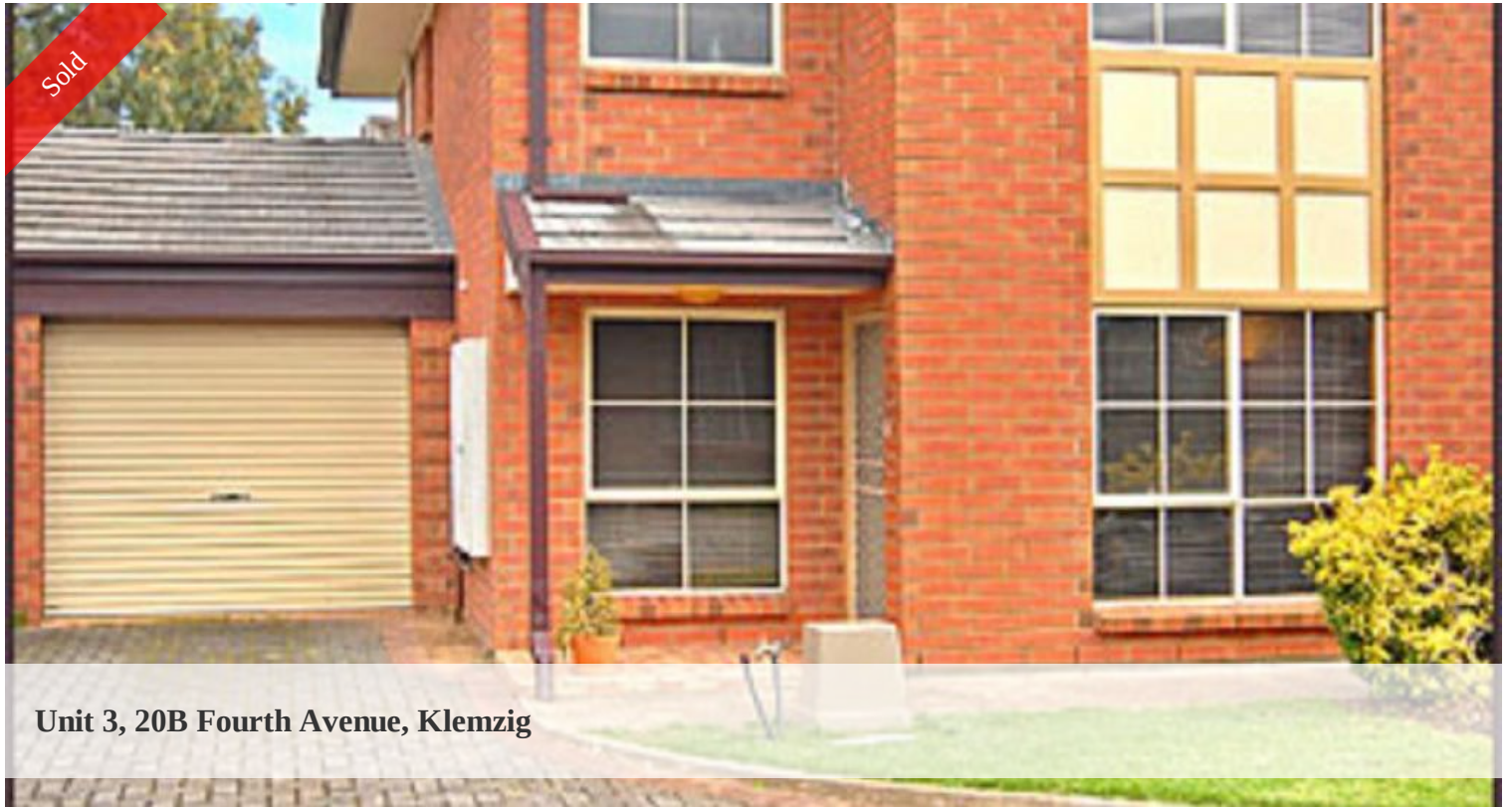
Unit 3, 20B Fourth Avenue, Klemzig